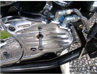
18. New adapter cover installed