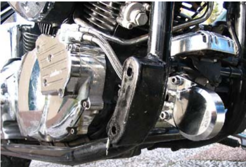
19. Fittings installed