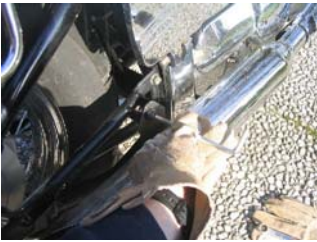
3. Remove Pipe