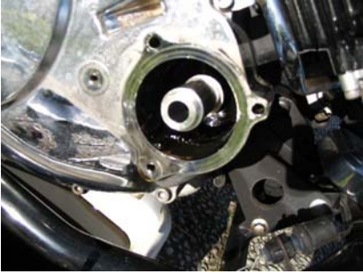
17. Cylinder installed