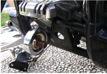
21. Before new filter