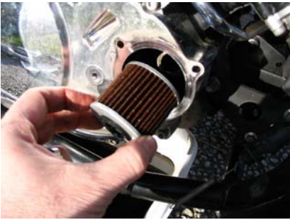
13. Remove filter