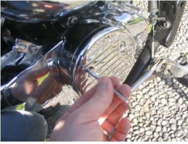
6. Remove cover