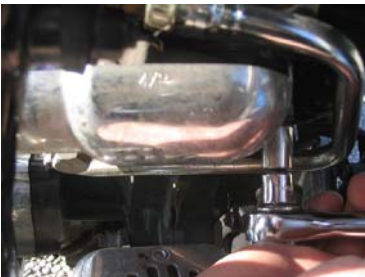
4. Remove Pipe