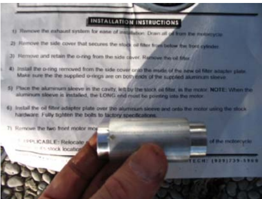
15. Long end toward motor