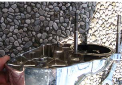
9. Cover and bolts