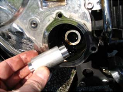
16. Install cylinder