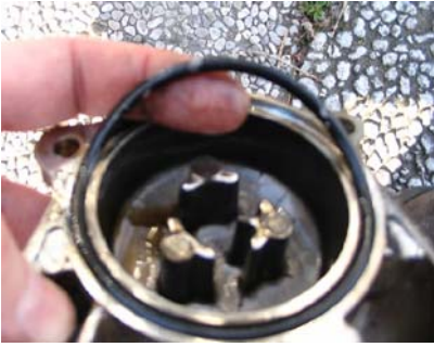
11. Removing O-ring