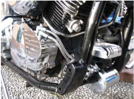
23. Install complete