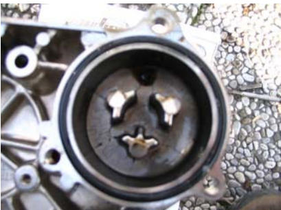
10. Cover with O-ring