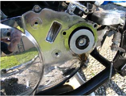
8. Cover removed