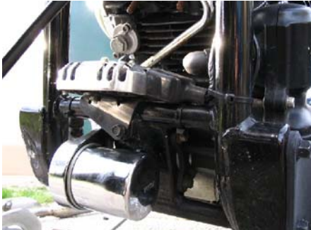
22. New Filter Installed