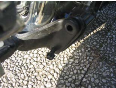
5. Remove Floor board