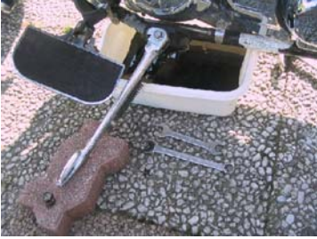
2. Drain oil