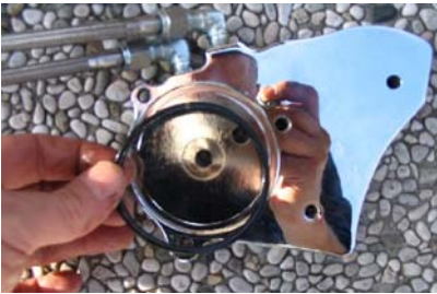
12. Installing O-ring