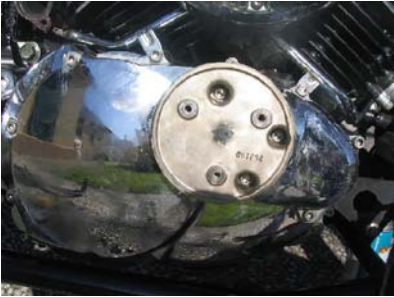
7. Cover removed