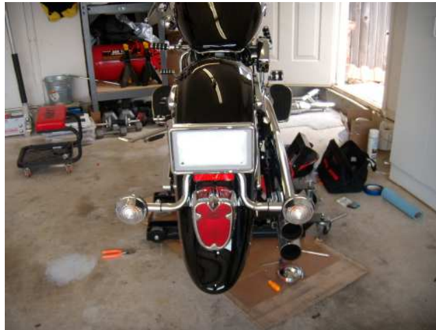
Original Plate and Signal